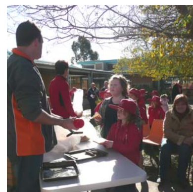
Parents, students and teachers enjoying Student of the Week barbeque.